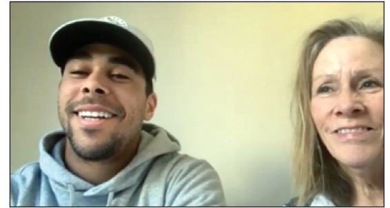
Surprising St. Mary's Health Clinics patients on Zoom with gift cards at Christmas.